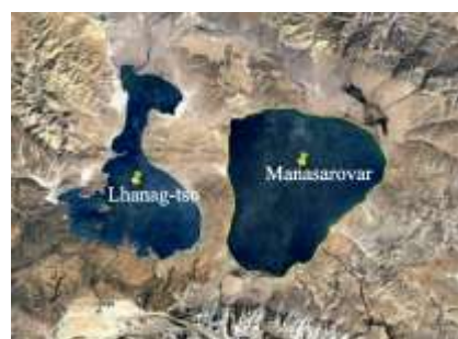
Figure 1 Map of Lake Manasarovar (.kmz format)

In 2015, the lake area was 412.14 km 2 , and the shoreline was 90.02 km. It is a plateau